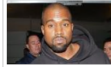
Man Launches Petition to Ban Kanye West From Glastonbury