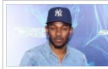
Kendrick Lamar Sets Record on Spotify With 'To Pimp a Butterfly'