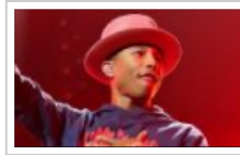
Ed Sheeran Previews 'Bloodstream' Music Video

Britney Spears Dispelled Pregnancy Rumors, Agreed to Host the Scandinavian Style Mansion Party